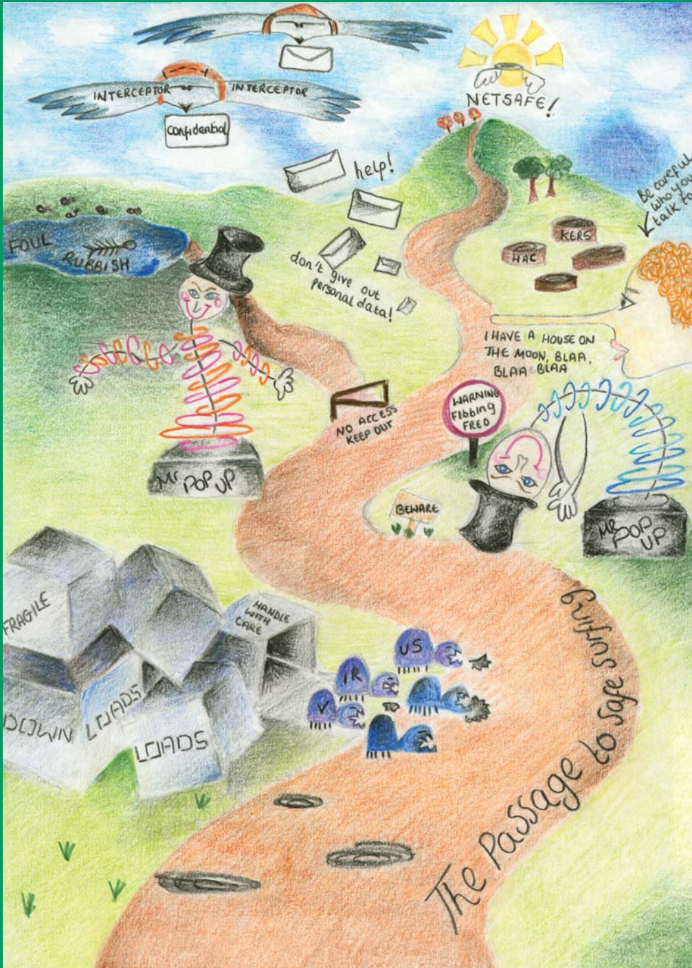
Byron Review competition winner