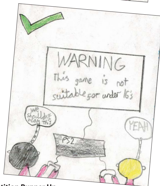
Competition Runner Up